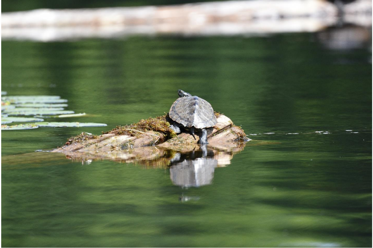
Northern map turtle in southern Redmond Bay.