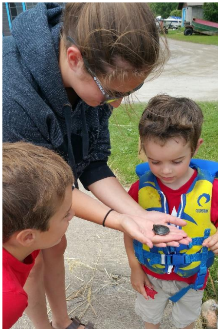
Young painted turtle captured on the Anchorage Marina road on July 20.