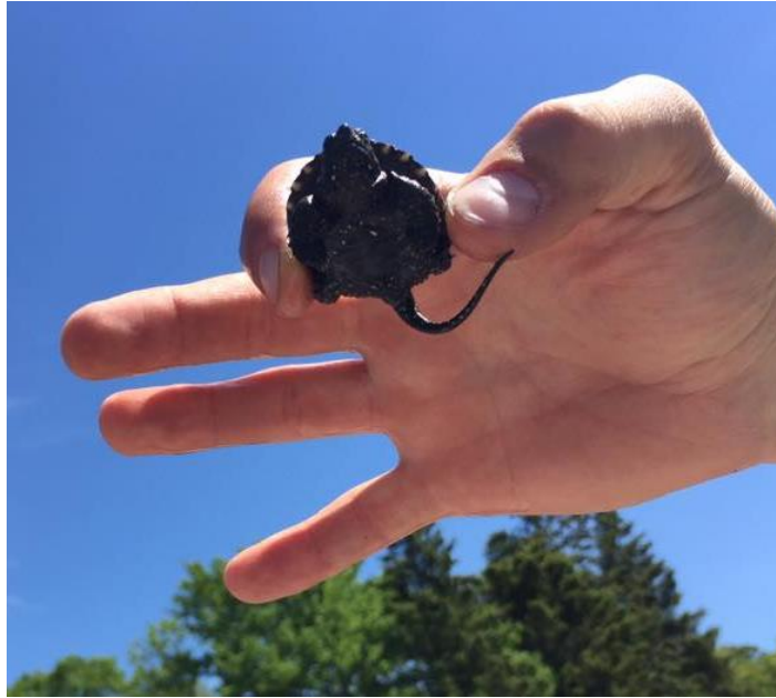
Young snapping turtle captured near the public boat launch in Brooks Bay.