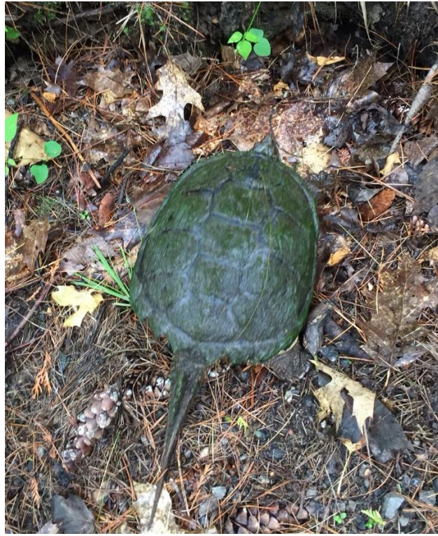
Snapping turtle