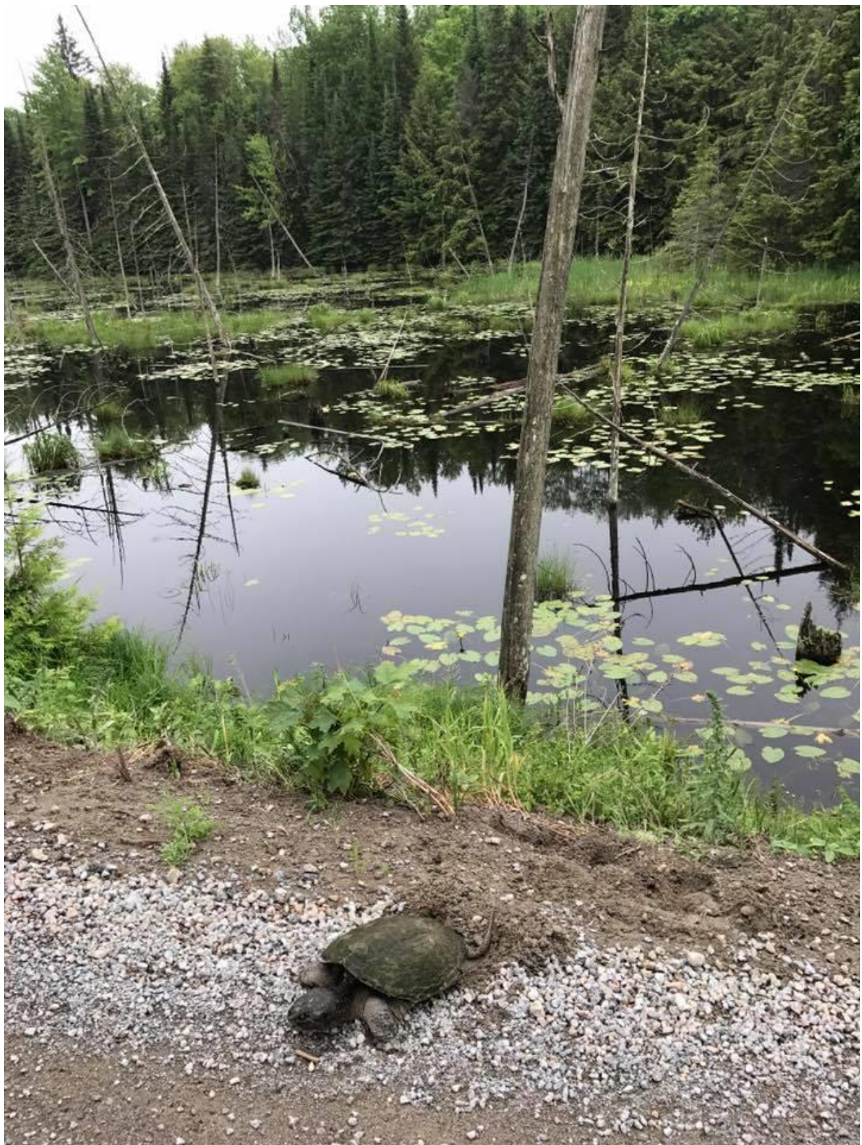
Nesting snapping turtle on McCoy Road adjacent to a small wetland (Frank Cirinna photo).